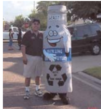
Gerit—San Juan's Recycling Mascot