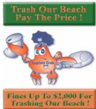
Captain Crab—Rio Grande Valley Recycling Mascot

Education and Training is a major factor on all source reduction & recycling efforts. Your local Recycling mascots could play a major role in these efforts. Therefore it is very important that everyone in the community become familiar with the recycling mascot. This article features only a few of the local recycling mascots. Additional mascots will be featured in the future.