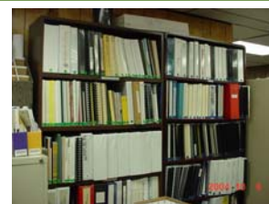
LRGVDC Resource and Information Center

The LRGVDC's Resource and Information Center is open to the public. It provides information on topics relating to Colonia Data, Environmental Resources, Solid Waste Information and Census data. You are welcome to visit the Center by contacting the Planning Department at (956) 682-3481.