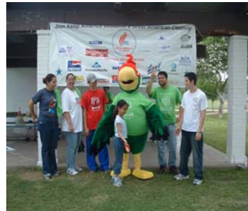
Rio the Parrot—Brownsville's Recycling Mascot