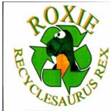
Roxie—Edinburg's Recycling Mascot