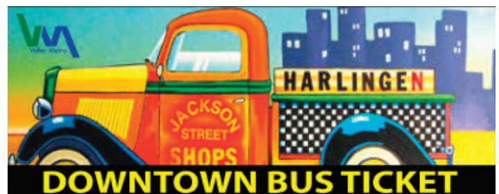
A photo of the downtown Harlingen bus ticket.

Rodney Gomez. "Any time a city wants to promote its local businesses, it's a good thing. I can see a future where shopper shuttles, subsidized by local businesses and local municipalities, encourage consumers to visit a wide variety of businesses, encouraging growth. Why? Because public transit improves mobility and supplies access to businesses."