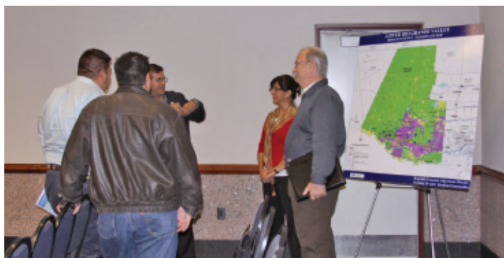
January 11, 2011, Hidalgo County meeting held at the McAllen Chamber of Commerce in McAllen

The first meeting was held in Rio Grande City. The group discussed a range of issues including: the need to include all of Starr County in the study, impacts of flood waters from Mexico, and the need to review local building codes in regards to building foundation heights.