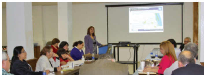
January 10, 2011, Starr County meeting held at the Starr County Industrial Foundation in Rio Grande City

The goal of this Plan is to help ensure economic growth and recovery following a natural disaster by identifying critical infrastructure projects needed to address severe flooding and drainage problems in the Valley, plus allow communities to plan for future land use projects. This effort will also include developing criteria for evaluation of capital improvements projects region-wide.