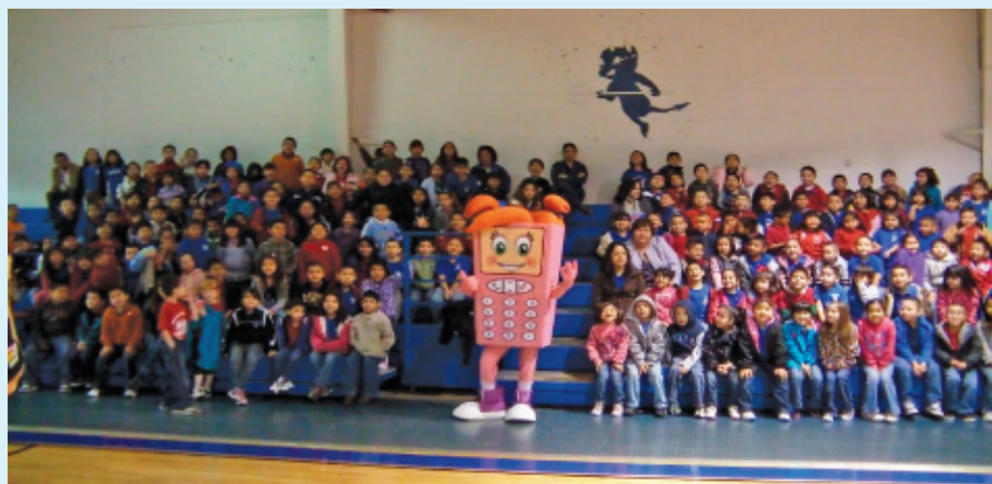
Cell Phone Sally poses for a picture with students from Monte Alto Elementary