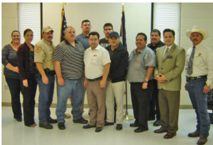
(Participants from the December 2010 Investigating Crimes against the Elderly Course)

During the December course participants attended from the San Benito Police Department, Cameron County Pct. 4 Constables Office, the La Feria Police Department, and the Hidalgo County Pct. 1 Constable’s Office.