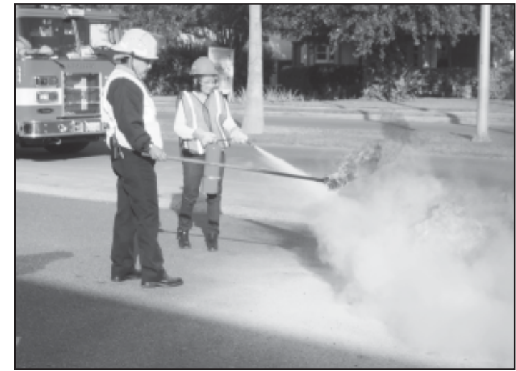
CERTS Mock Exercise

The course is open to all residents and organizations of the three county area which are Cameron, Hidalgo and Willacy Counties who are at least 16 years of age. Those under 18 are required to be accompanied by a parent. There is no fee and printed materials will be provided on-site, however, participants may be required to bring some personal equipment or supplies. For more information on CERT and points of contact within your community, please contact the LRGVDC at 956-682-3481.